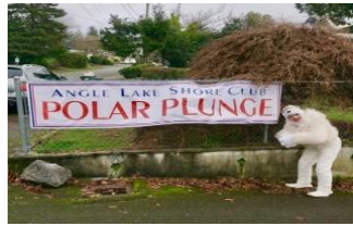
POLAR PLUNGE PAGE 4