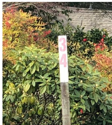
by Fuzz Hill

created for each driveway showing the houses, approximate dimension, length of driveway for hose lays, the location of hydrants on the driveway, cross streets, and adjacent driveways. If access was restricted, the closest alternative was shown. For those with restricted access, letters were sent to the residents, advising them to improve their access for fire apparatus, usually by trimming back the brush and trees.