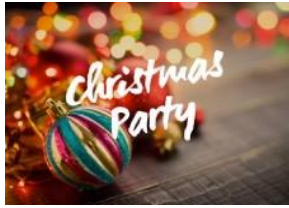
CHRISTMAS PARTY PAGE 3