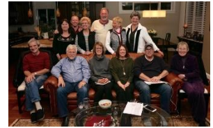
ALSC BOARD TEAM