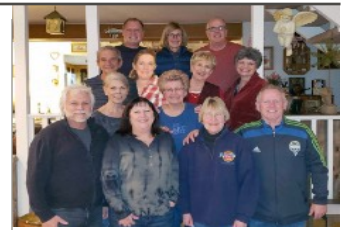
ALSC BOARD TEAM