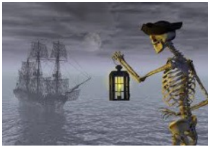
BOO CRUISE PAGE 6