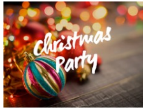
CHRISTMAS PARTY PAGE 7